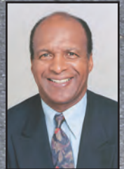
Jesse White Illinois Secretary of State